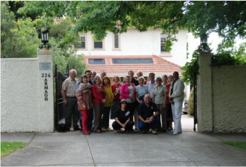
Some of the participants and faculty of the "Life Still Matters" Workshop