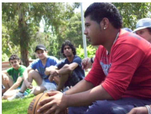
Story sharing among the participants

A short DVD of the camp is being produced and will include interviews with some of those who took part. A fuller report will be written and sent to the National Australia Bank who provided a generous grant in support of the camp.