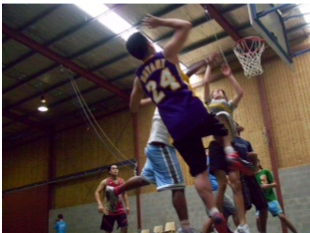
Camp participants in action

The camp also provided participants with sessions on the themes – Challenge, Choice, and Change – to equip with them with life tools in order to respond to the issues many live with on a day to day basis.