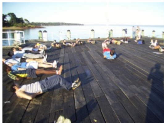
Training and exercise where a part of the camp

The camp also provided participants with sessions on the themes – Challenge, Choice, and Change – to equip with them with life tools in order to respond to the issues many live with on a day to day basis.