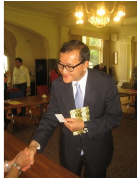
Cambodian Opposition leader, Rainsy Sam

in order to effect change. Another mentioned, "I know that inner reflection and sharing are essential to give me a sense of coherence and purpose and I will