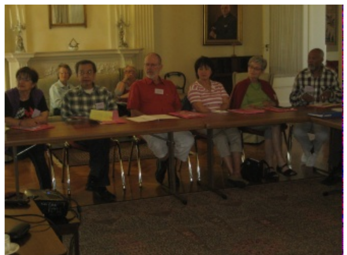
Participants in the workshop listening in with interest

It will be very interesting to see what develops from this workshop. Numerous others wanted to join the event but were unable to because of prior commitments. Clearly we need to have more of these!